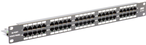
DTP50 1RU 50port Voice Panel

The AMDEX range of 1RU Voice Patch Panels offers the installer a simple solution to intergrate voice channels into a structured cabling system. Our standard panel is available as either a IDC punchdown version (DTP50) or with 2 x 25pr female AMP connectors (DTP50/AMP). Our range also includes a breakout panel for use with the NEC Univerge System (DTP40/40).